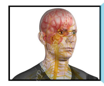
This is a genetic disorder which affects the functioning of the brain